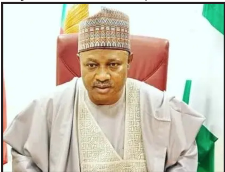
Governor Uba Sani

In their response, the local government chairmen pledged their commitment to working closely with the state government to fulfil its 7-point SUSTAIN agenda, which focuses on rural economic transformation and overall development. They expressed their appreciation to the governor for his dedication to rural development and requested his consideration for essential projects within their respective councils.