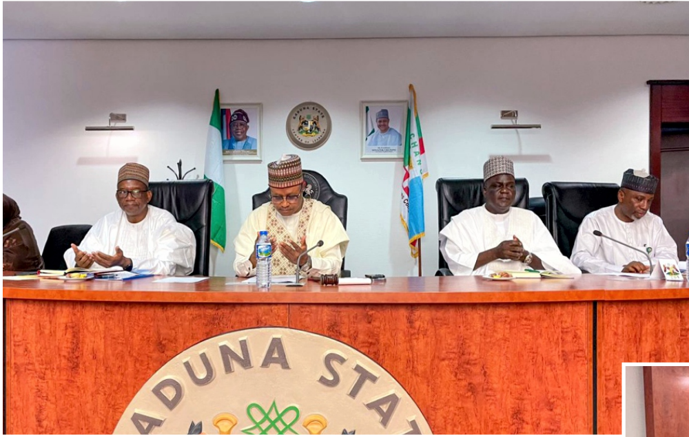
▲ THE INAUGURAL MEETING OF THE STATE CABINET