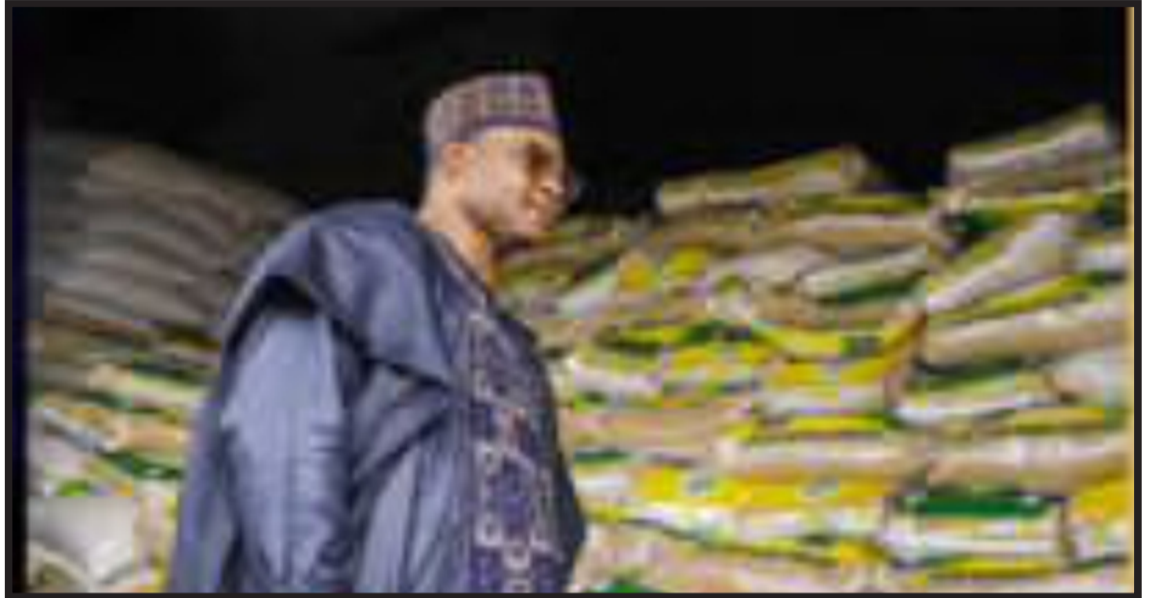
Governor Uba Sani flagged off the distribution of 50kg bag of rice each to 210,000 poor and vulnerable households in Kaduna State at Dankande, Igabi Local Government.

ailments to their doorsteps. While celebrating the resilience of the girl-child, governor Uba Sani gave the assurances of his commitment to ensuring that girls across the state had access to quality education, digital literacy and crucial life skills.