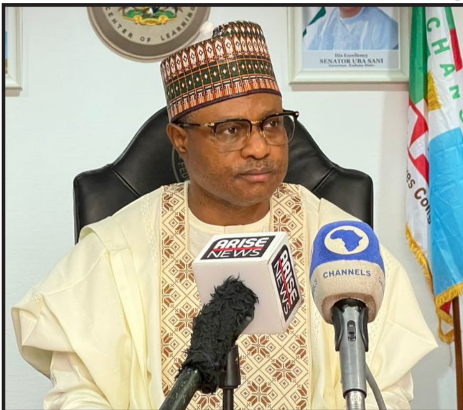
Governor Uba Sani

Therefore, the call for reduced tuition fees in Kaduna state is not merely an economic educational matter but a reflection of our values as a society. The decision to review downward, tuition fees by Senator Uba Sani's administration shows a commitment to equal opportunities, to nurturing the