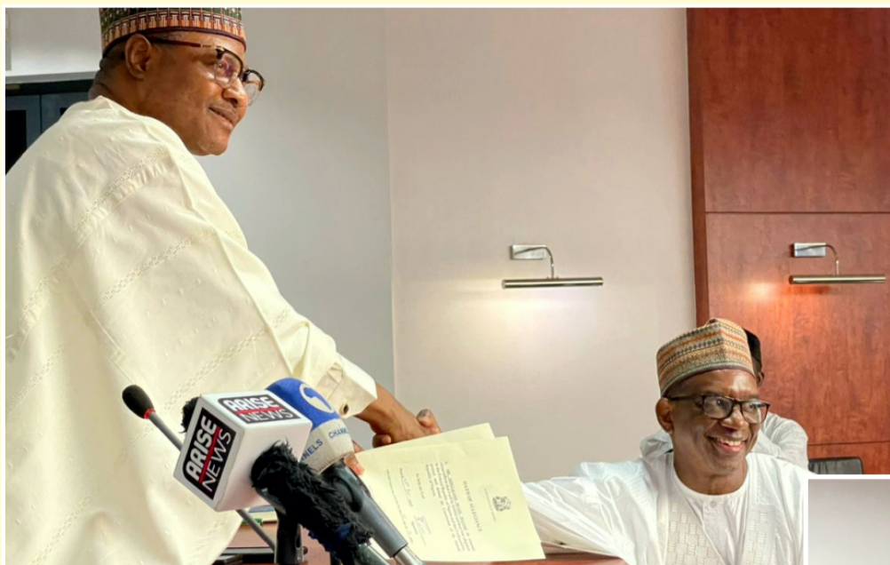
▲ GOVERNOR UBA SANI CONGRATULATING THE NEW SSG,