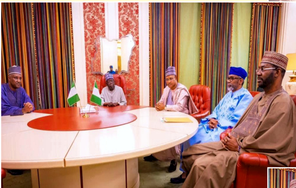
▲ GOV. UBA SANI WITH OTHER PROMINENT SONS OF KADUNA ON A WORKING