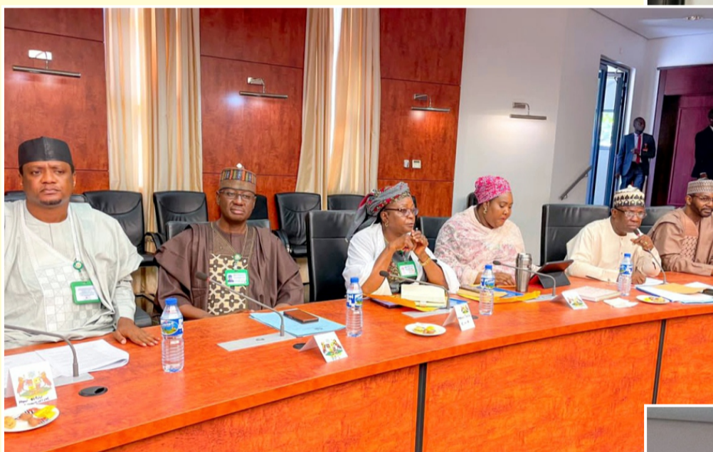
▲ CROSS SECTION OF GOVERNMENT OFFICIALS AT THE SWEARING-IN OF SSG