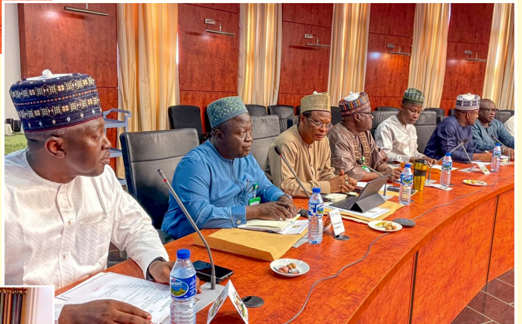
▲ CROSS SECTION OF THE STATE CABINET AT THE INAUGURAL MEETING