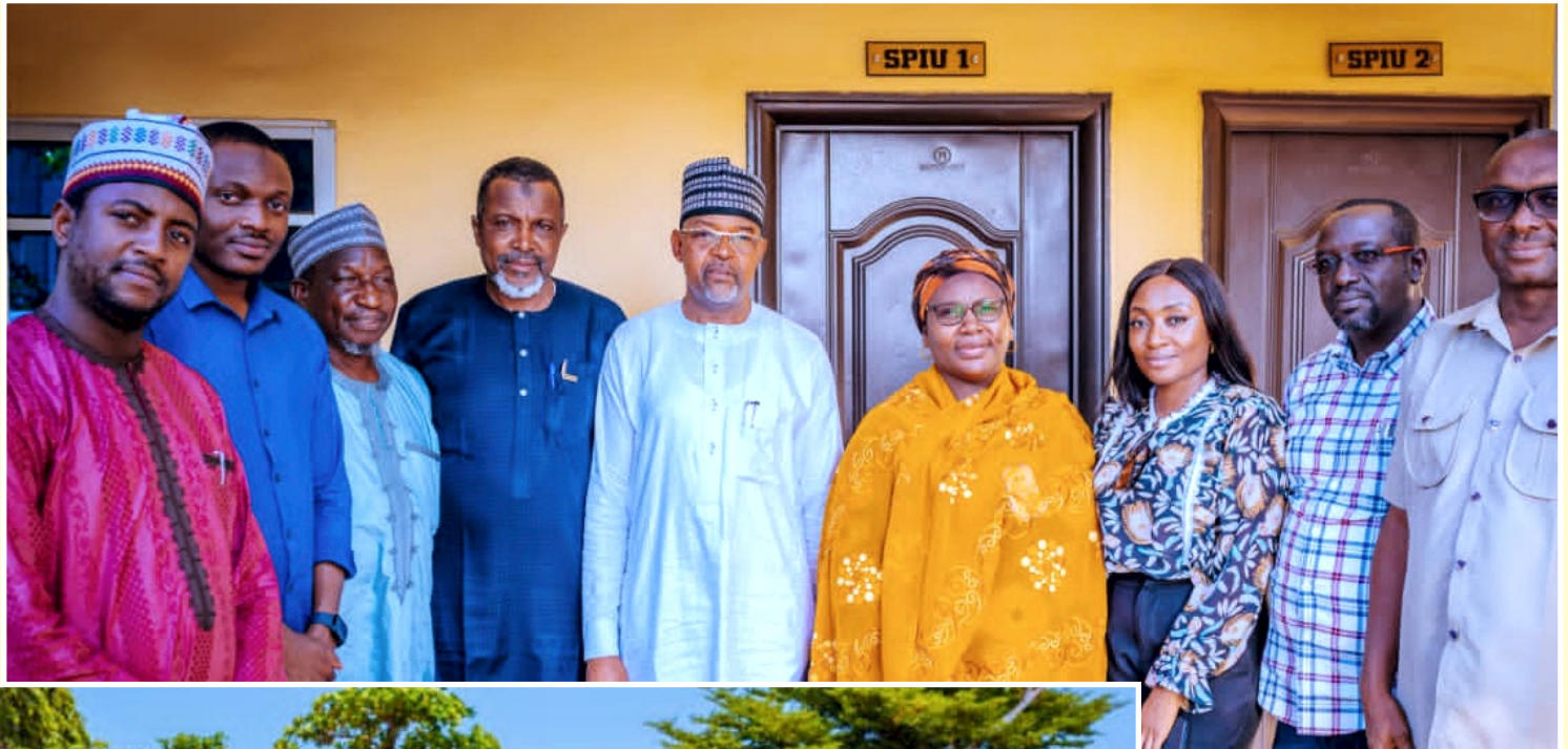
THE WORLD BANK TEAM, NPCU AND MINISTRY OFFICIALS ON TOUR OF PROJECTS