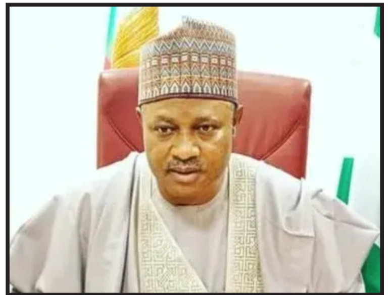
Governor Uba Sani

a 4-classroom block, a one-storey building with 8 classrooms, an administrative block, a laboratory, a multipurpose hall, and VIP toilets. These schools will ensure that students have conducive and safe learning environment that will enhance learning outcomes and are expected to be completed between 6-9 months. The Governor, Senator Uba Sani on the occasion reiterated his unflinching commitment and dedication to the development of education in Kaduna State.