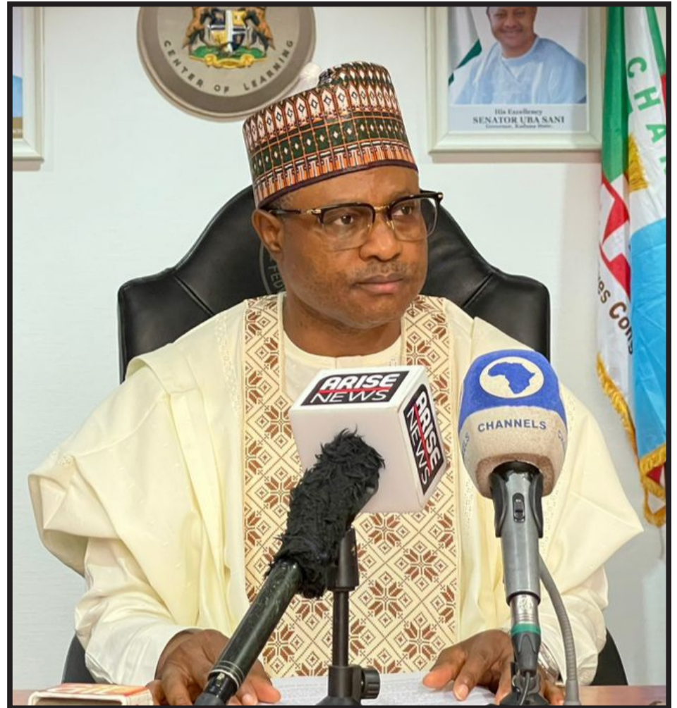
Senator Uba Sani, Executive Governor Kaduna State