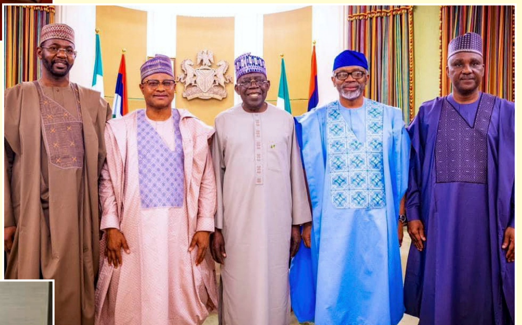
▲ GOVERNOR UBA SANI WHO LED SOME PROMINENT SONS OF KADUNA ON A COURTESY CALL ON PRESIDENT BOLA TINUBU RECENTLY IS SEEN IN THIS PHOTOGRAPH WITH THE PRESIDENT AND CHIEF OF STAFF TO THE PRESIDENT MR. FEMI GBAJABIAMILA