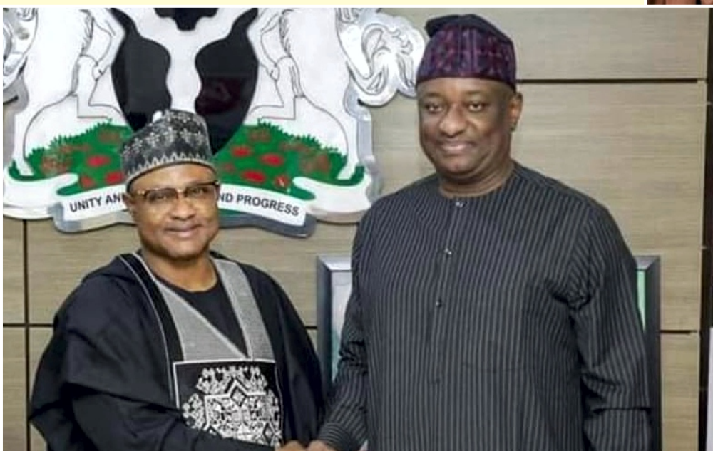
▲ GOVERNOR UBA SANI WITH MINISTER OF AVIATION MR. FESTUS KIYAMO SAN WHEN HE VISITED THE MINISTER IN ABUJA TO SOLICIT ASSISTANCE OVER KADUNA AIRPORT .