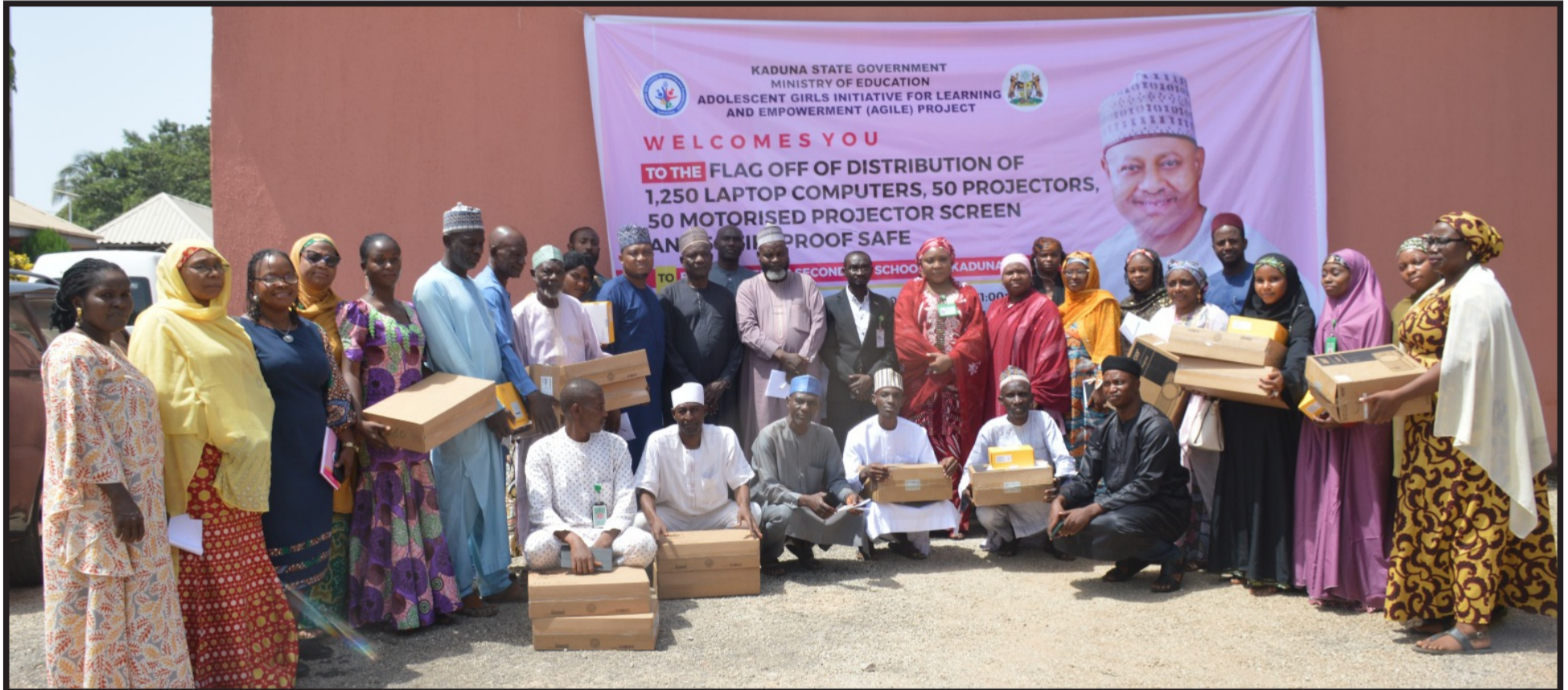
A group photograph of benefiting schools of Digital Literacy items donated by AGILE SPIU at the event.

contributing to a greener and more sustainable Nigeria. "As we inaugurate this Kakau station, we also unlock investment opportunities for local businesses in Kaduna State's industrial and automotive gas sectors", he added.