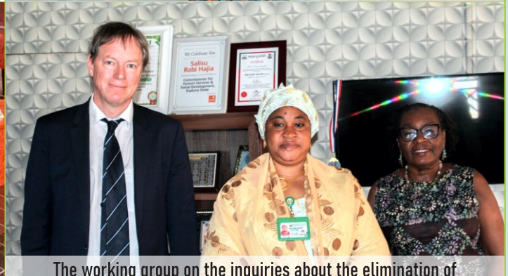
The working group on the inquiries about the elimination of discrimination against women (CEDAN) on fact finding visit to Kaduna with commissioner of human services