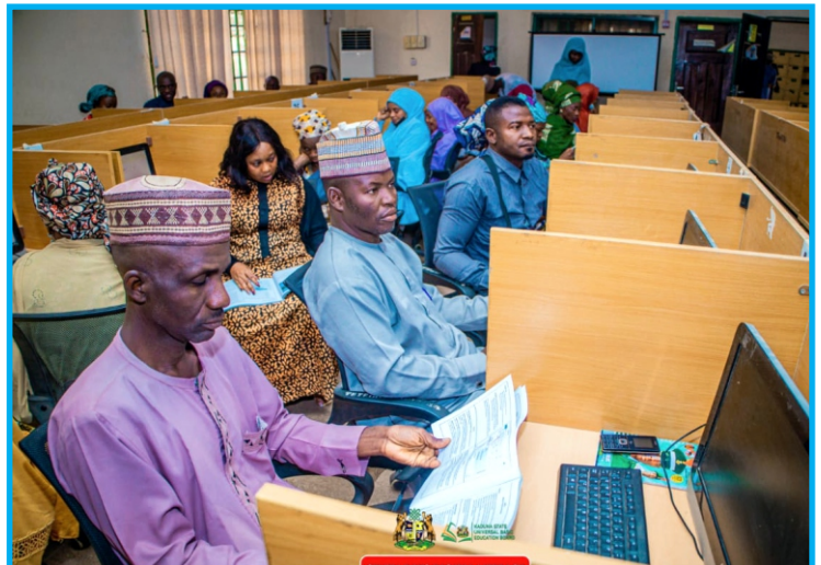
Cross section of teachers at the ICT Training

The 7-day training drew teachers from Kaduna, Zaria and Kafanchan Senatorial districts.