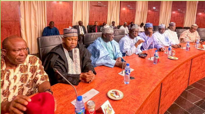
Cross section of personalities at the Sir Kashim Ibrahim House during one of those condolence visits on the Tudun Biri incident