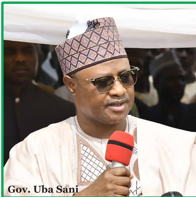
Gov. Uba Sani

comprehensive investigation into the incidents showcases his dedication to ensuring justice is