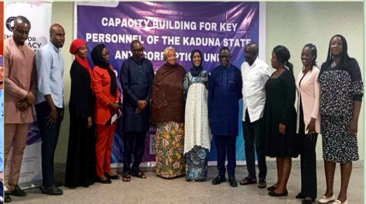
Members of Kaduna State ACU and CDD pose during a meeting