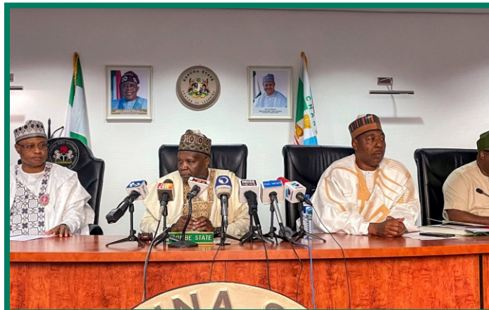
A Meeting of the Northern States Gov's Forum held at the Sir Kashim Ibrahim House on Friday. From left is Gov. Uba Sani, Chairman of the forum, Alhaji Inuwa Yahaya Gov. of Gombe State (Centre), and Gov. Umara Zulum of Borno State.

He said that the president had in his discussion with him assured that the victims will be fully compensated a position the Vice-president conveyed to him when he led the Federal Government delegation to the state.