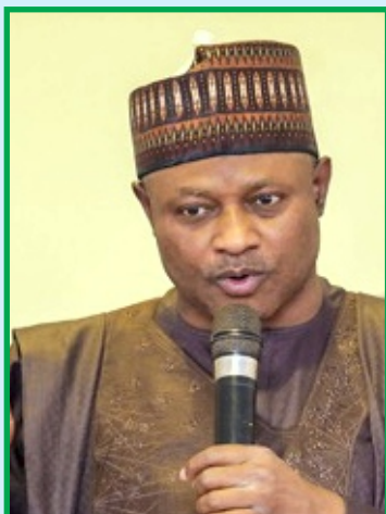
Governor Uba Sani

K aduna State Governor, Senator Uba Sani, has reinstated his call on the National Assembly to update obsolete security laws to effectively address current security challenges.