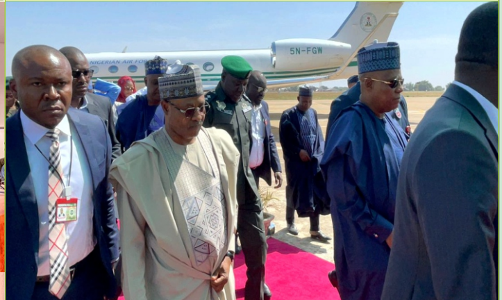
Governor Uba Sani with Vice President Kashim Shetima at the Airport