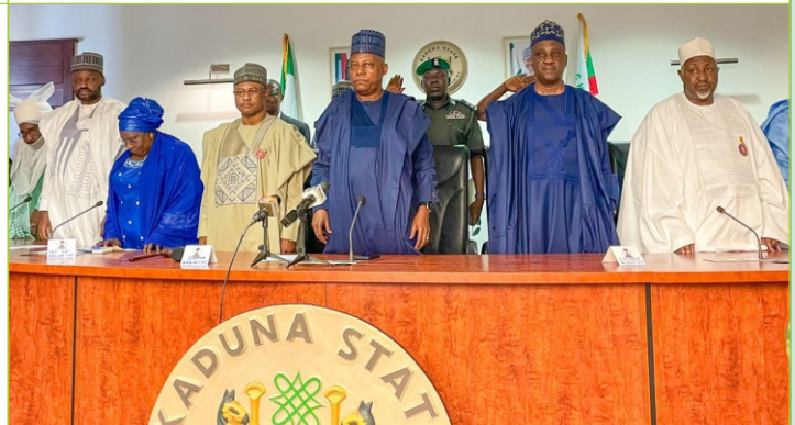
Vice President Shettima, Governor Uba Sani, speaker house of Reps. Tajudeen Abass and Minister of Defence Badaru before a meeting with Religious Leaders