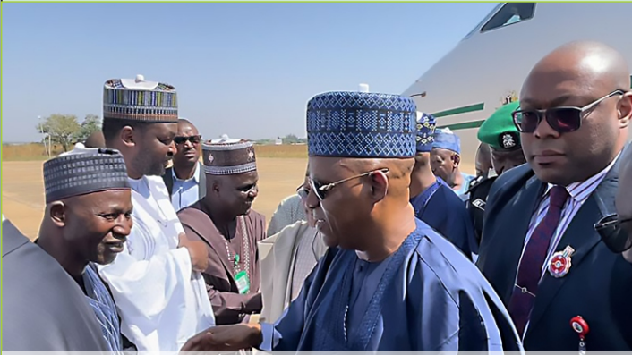
Vice President Kashim Shettima meets Kaduna State Government officials on arrival from Abuja on condolence visit over the Tudun Biri tragedy