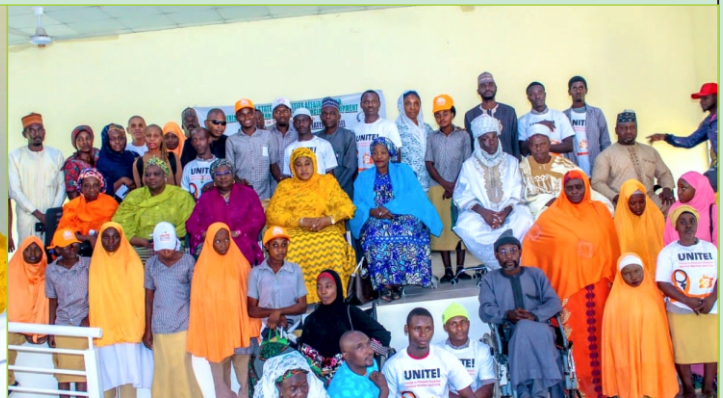
Officials and Participants at the end of activities marking the end of the 16th day activism on international day for Persons Living with Disabilities