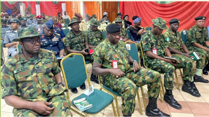
Cross-section of Army officers and members of the Nigerian Legion Kaduna Branch (below) at the launch of the 2024 Emblem appeal week