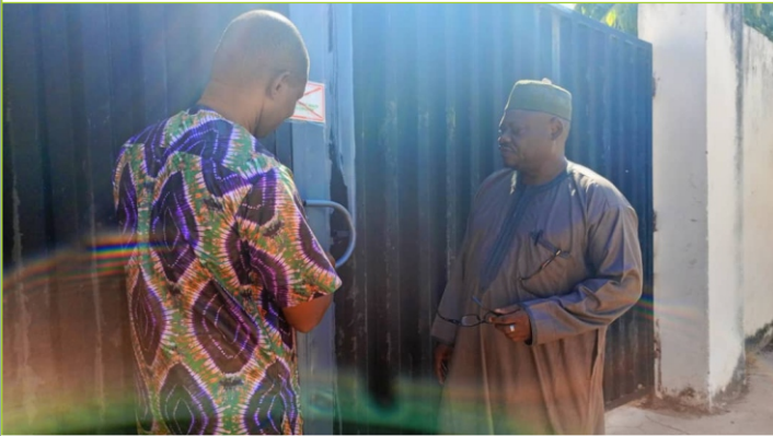
Chairman & Sec, of the committee on private health establishment sealing a private hospital which fell foul of professional ethics