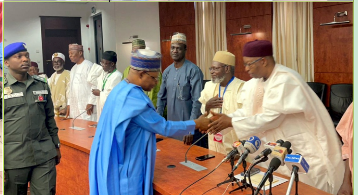
Kaduna elders committee led by Alhaji Abubakar Mustapha on condolence visit to Governor Uba Sani