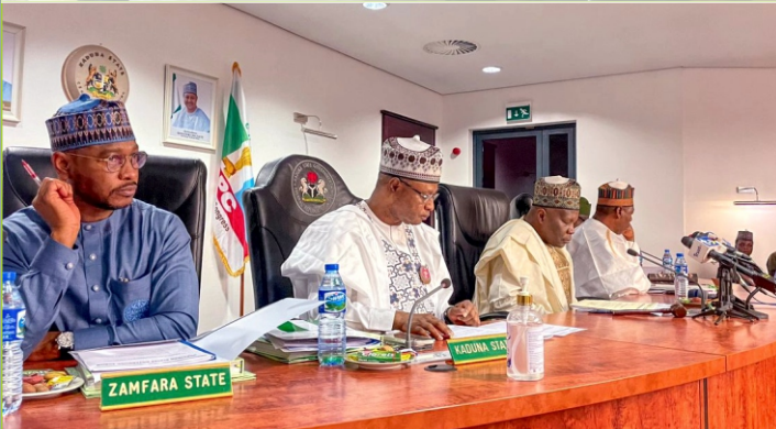
Northern Governors Forum meeting at sir Kashim Ibrahim House Kaduna