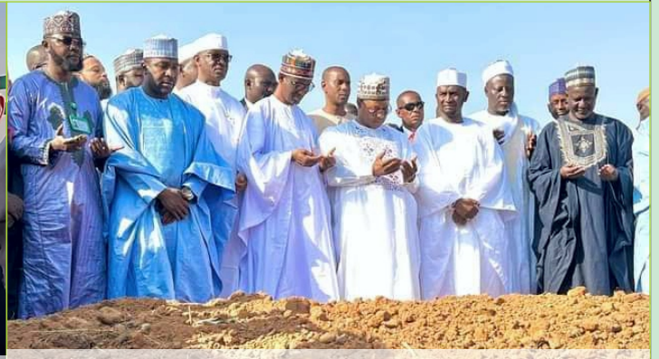
NSA Nuhu Ribadu, Governor Uba Sani and other VIPs praying at the grave side of the deceased in Tudun Biri