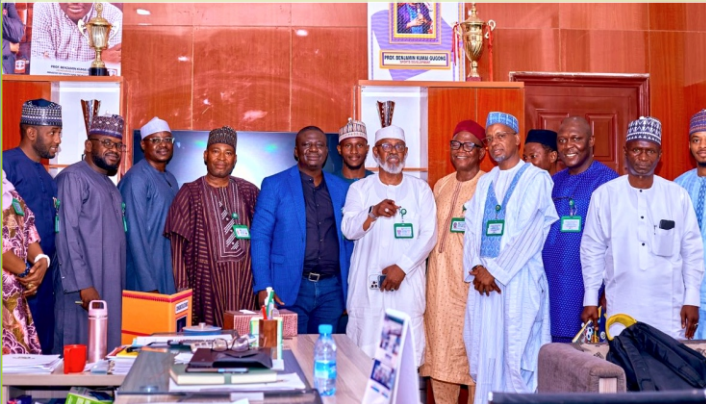
Group Special Advisers and Assistants to the Gov. on a working visit to the Commissioner of Sports Development